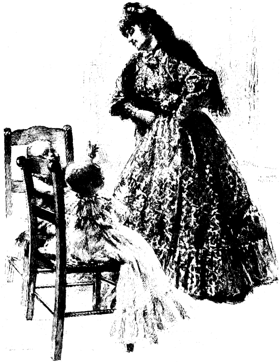
Roxy was a dotting fool of a mother